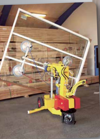
The lifting device has a multifunctional swivel head.