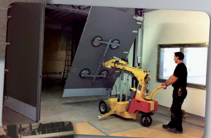
The lifting capacity and precise movements of the Smartlift make the machine ideal for installation of e.g. heavy fire doors.