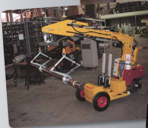
The SL 580 Maxi is increasingly used in industry for heavy lifting jobs.