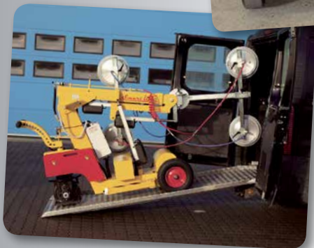
The Smartlift is easily transported in a van or on a trailer