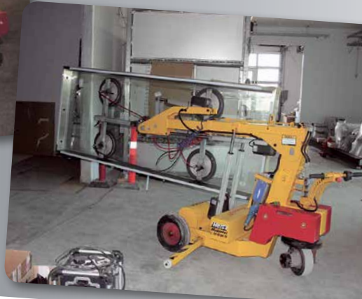
Windows are kept securely in place throughout the installation process.

N.A. Christensensvej 39 DK-7900 Nykøbing Mors Tel.: +45 97 72 29 11 E-mail: smart@smartlift.dk www.smartlift.dk